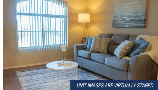
UNIT IMAGES ARE VIRTUALLY STAGED